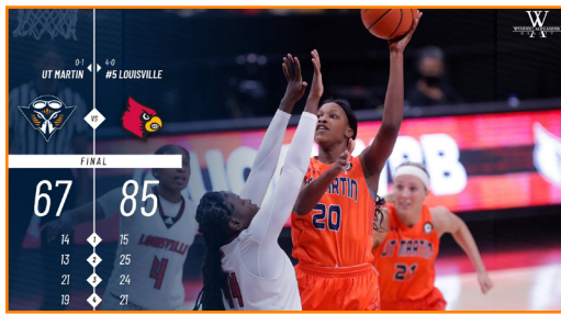
UT Martin at #5 Louisville 12/6/20 | 11 am at KFC Yum! Center - Louisville, Ky.