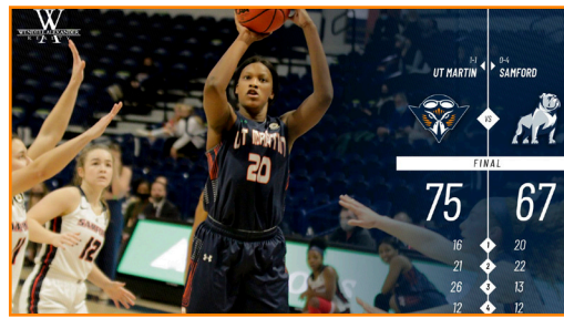
UT Martin at Samford 12/8/20 | 6 pm at Pete Hanna Center - Birmingham, Ala.