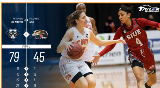
UT Martin vs. SIUE

1/30/21 | 1 pm at Elam Center - Martin, Tenn.