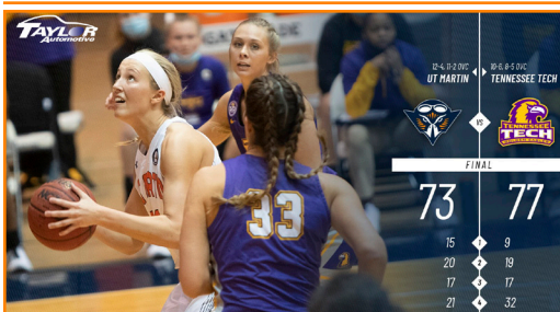
UT Martin vs. Tennessee Tech

2/6/21 | 1 pm at Elam Center - Martin, Tenn.