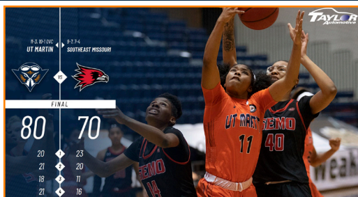
UT Martin vs. Southeast Missouri

2/1/21 | 4 pm at Elam Center - Martin, Tenn.