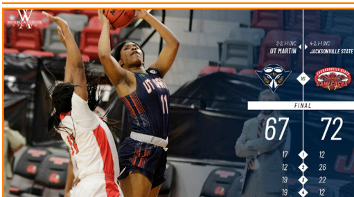
UT Martin at Jacksonville State 12/30/20 | 4:30 pm at Pete Mathews Coliseum - Jacksonville, Ala.