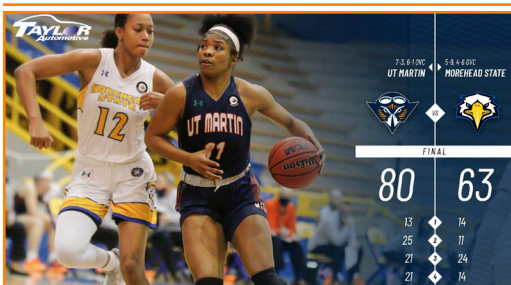
UT Martin at Morehead State 1/23/21 | 1 p.m. at Johnson Arena - Morehead, Ky.