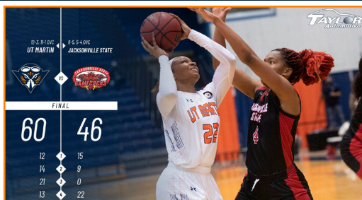
UT Martin vs. Jacksonville State

2/4/21 | 5 pm at Elam Center - Martin, Tenn.