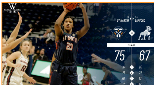
UT Martin at Samford 12/8/20 | 6 pm at Pete Hanna Center - Birmingham, Ala.