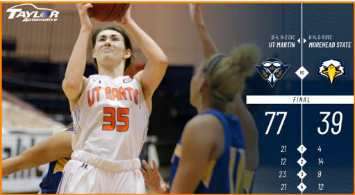
UT Martin vs. Morehead State 2/18/21 | 5 pm at Elam Center - Martin, Tenn.