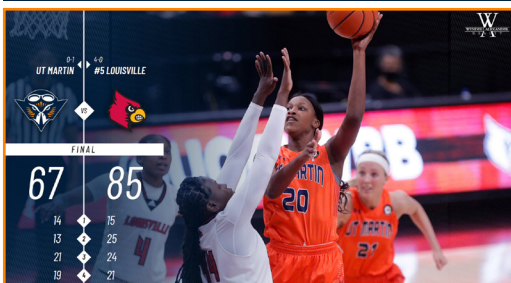
UT Martin at #5 Louisville 12/6/20 | 11 am at KFC Yum! Center - Louisville, Ky.