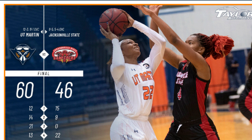
UT Martin vs. Jacksonville State 2/4/21 | 5 pm at Elam Center - Martin, Tenn.