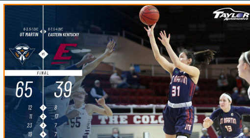
UT Martin at Eastern Kentucky 1/21/21 | 5 pm at McBrayer Arena - Richmond, Ky.