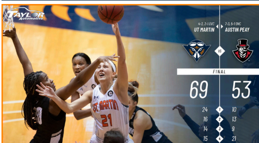
UT Martin vs. Austin Peay 1/14/21 | 5 pm at Elam Center - Martin, Tenn.