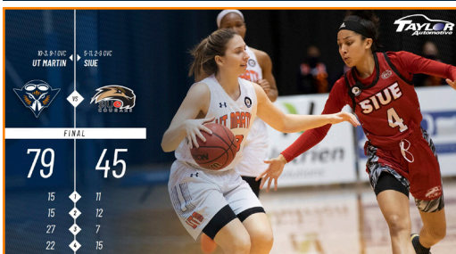
UT Martin vs. SIUE 1/30/21 | 1 pm at Elam Center - Martin, Tenn.