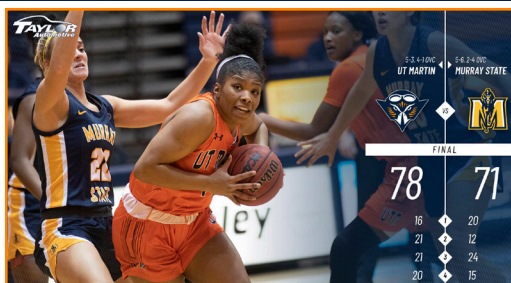
UT Martin vs. Murray State 1/16/21 | 1 pm at Elam Center - Martin, Tenn.