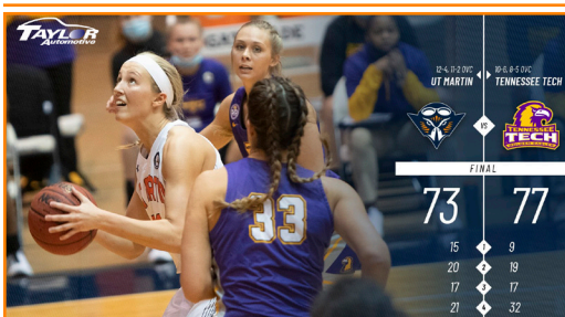
UT Martin vs. Tennessee Tech 2/6/21 | 1 pm at Elam Center - Martin, Tenn.