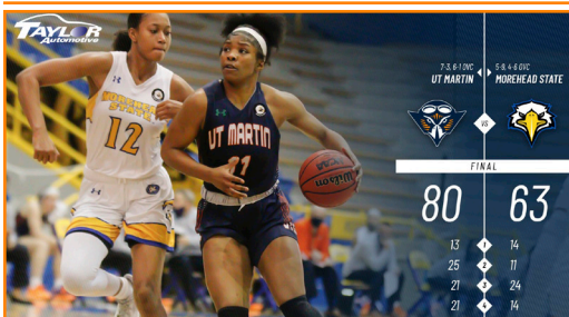
UT Martin at Morehead State 1/23/21 | 1 p.m. at Johnson Arena - Morehead, Ky.