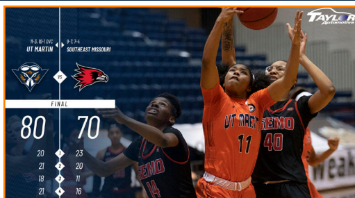
UT Martin vs. Southeast Missouri 2/1/21 | 4 pm at Elam Center - Martin, Tenn.