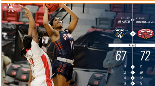
UT Martin at Jacksonville State 12/30/20 | 4:30 pm at Pete Mathews Coliseum - Jacksonville, Ala.