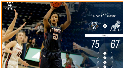
UT Martin at Samford 12/8/20 | 6 pm at Pete Hanna Center - Birmingham, Ala.