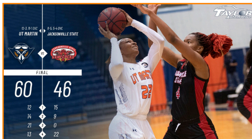
UT Martin vs. Jacksonville State 2/4/21 | 5 pm at Elam Center - Martin, Tenn.