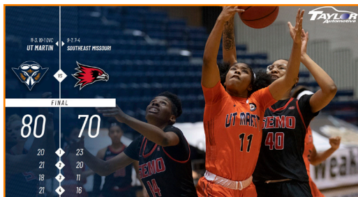
UT Martin vs. Southeast Missouri 2/1/21 | 4 pm at Elam Center - Martin, Tenn.