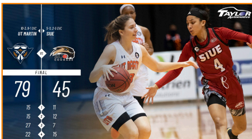
UT Martin vs. SIUE 1/30/21 | 1 pm at Elam Center - Martin, Tenn.