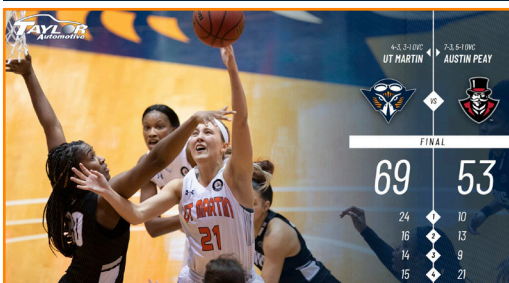
UT Martin vs. Austin Peay 1/14/21 | 5 pm at Elam Center - Martin, Tenn.