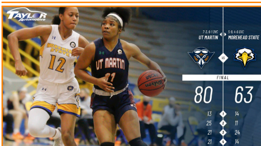
UT Martin at Morehead State 1/23/21 | 1 p.m. at Johnson Arena - Morehead, Ky.