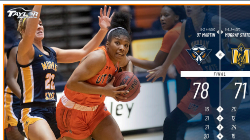
UT Martin vs. Murray State 1/16/21 | 1 pm at Elam Center - Martin, Tenn.