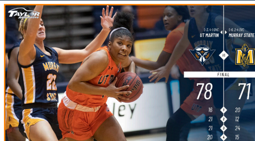
UT Martin vs. Murray State 1/16/21 | 1 pm at Elam Center - Martin, Tenn.