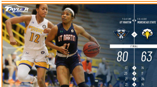
UT Martin at Morehead State 1/23/21 | 1 p.m. at Johnson Arena - Morehead, Ky.