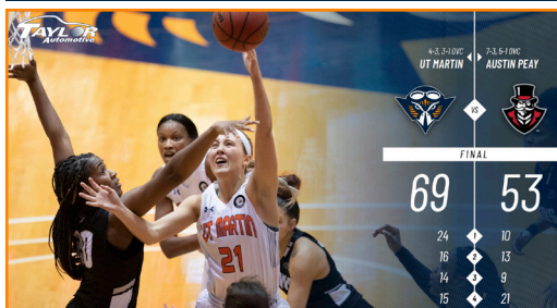
UT Martin vs. Austin Peay 1/14/21 | 5 pm at Elam Center - Martin, Tenn.