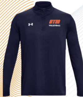
UNDER ARMOUR MERCHANDISE