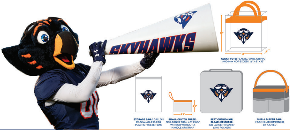
CLEAR TOTE: PLASTIC, VINYL, OR PVC AND MAY NOT EXCEED 12" X 6" X 12"